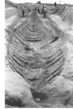
The 27m long ship

The Head of The British Museum said that "We might get rid of them after a few years because of how old and rusty they are"