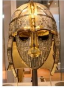
Anglo-Saxon helmet worn at war.

Under the burial mounds that were excavated, they found an Anglo-Saxon iron helmet a whale casket, a sword and a burial chamber.