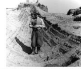
One of the workers in the 27m long ship at Sutton Hoo