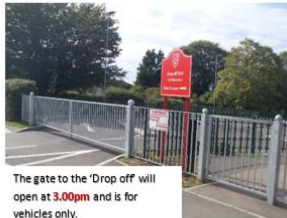
The gate to the 'Drop off' will open at 3.00pm and is for vehicles only.