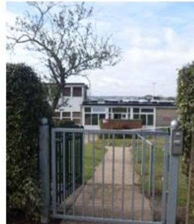
This gate is for access to the main office – the gate will open at 3.10pm

This gate is the nearest access to year 4 class rooms – the gate will open at 3.10pm . Please use this gate if you are coming from Rectory Lane end.