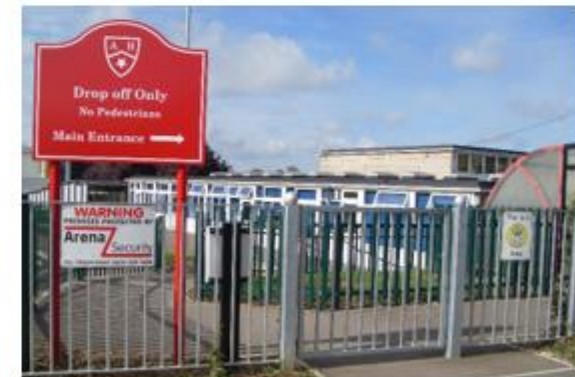
This gate is for pedestrian access from Rectory Lane – the gate will open at 3.10pm