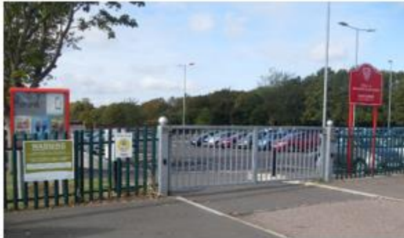
The gate for the staff and visitor car park is for vehicles only and must not be used for collection/drop off