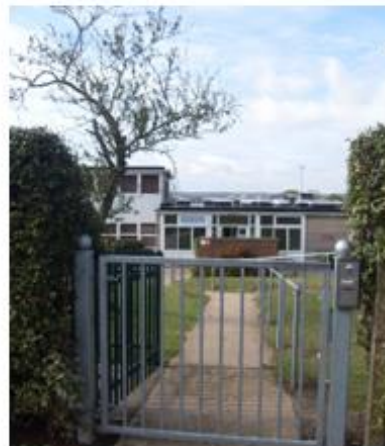
This gate is for access to the main office – the gate will open at 3.00pm

This gate is the nearest access to year 4 class rooms – the gate will open at 3.10pm . Please use this gate if you are coming from Rectory Lane end.