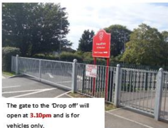
The gate to the 'Drop off' will open at 3.10pm and is for vehicles only.