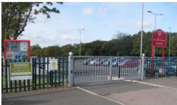
The gate for the staff and visitor car park is for vehicles only and must not be used for collection/drop off