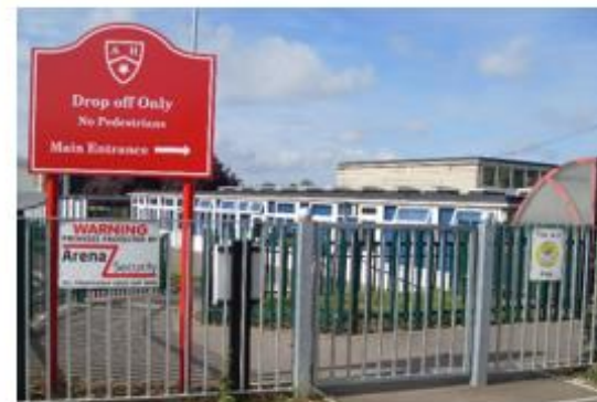
This gate is for pedestrian access from Rectory Lane – the gate will open at 3.00pm